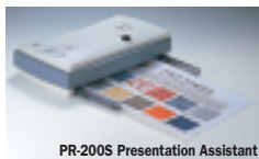
PR-200S Presentation Assistant

The LV-7545 supports both Windows and Mac platforms, and is compatible with a wide variety of devices including the PR-200S, which allows on-the-fly document scanning and projection. Furthermore, the projector comes equipped with a DVI interface for high-quality display of digital data.