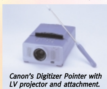
Canon's Digitizer Pointer with LV projector and attachment.

Canon's new Digitizer is a pointer/wireless mouse that works with your Canon LV-7325/20 projector and lets you stand in front of your audience and direct their attention to pertinent copy or detail, while you interact with the projected image as if it were a large screen computer display. There are no special screens or equipment required and you can use it almost anywhere. Now, teachers, trainers, litigators and presenters in general can focus